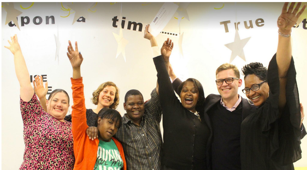
Graham workshop graduates and staff