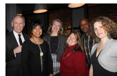
Guests at our 10th Anniversary, top, and Friendraiser